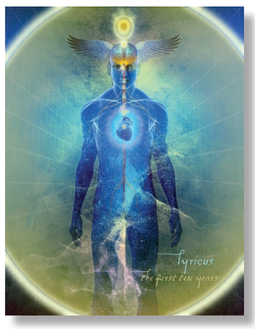
The Sovereign Integral is the transparent Being of expansion, uniquely fit for the era in which we have begun to enter.<sup>87</sup>